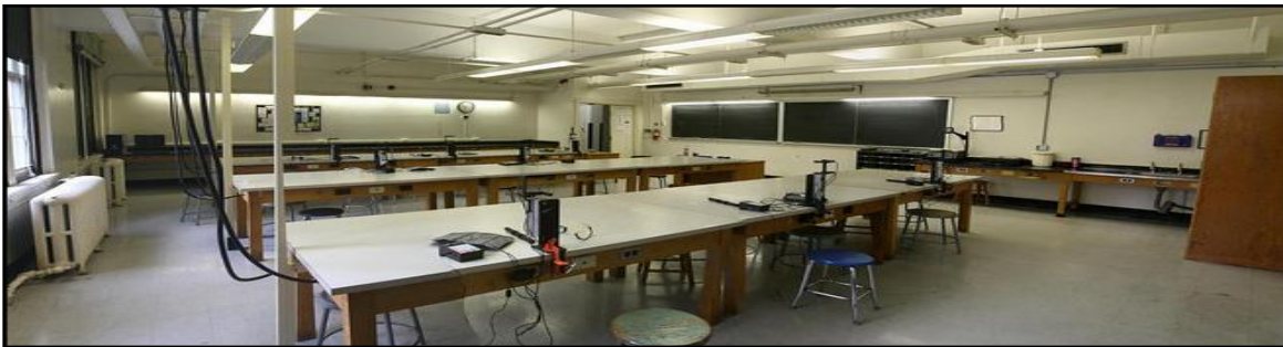
Figure 1 - Traditional lab

SCALE-UP stands for Student-Centered Active Learning Environment for Undergraduate Programs. It is an active learning approach to introductory science that was developed by physics Professor Robert Beichner at NC State University in 1997. It has since been implemented at dozens of other higher education institutions. In most implementations, it combines separate lecture and lab sections into one integrated experience. Classroom activities emphasize team-based problem solving activities. Classroom design is an important aspect of this model, as students must be able to work effectively in groups of three and instructors must be able to move freely about the classroom to interact with student teams. Labs designed around the traditional bench model do not typically facilitate this level of interaction (Figure 1). Additional SCALE-UP resources are available online ( http://scaleup.ncsu.edu/ ).